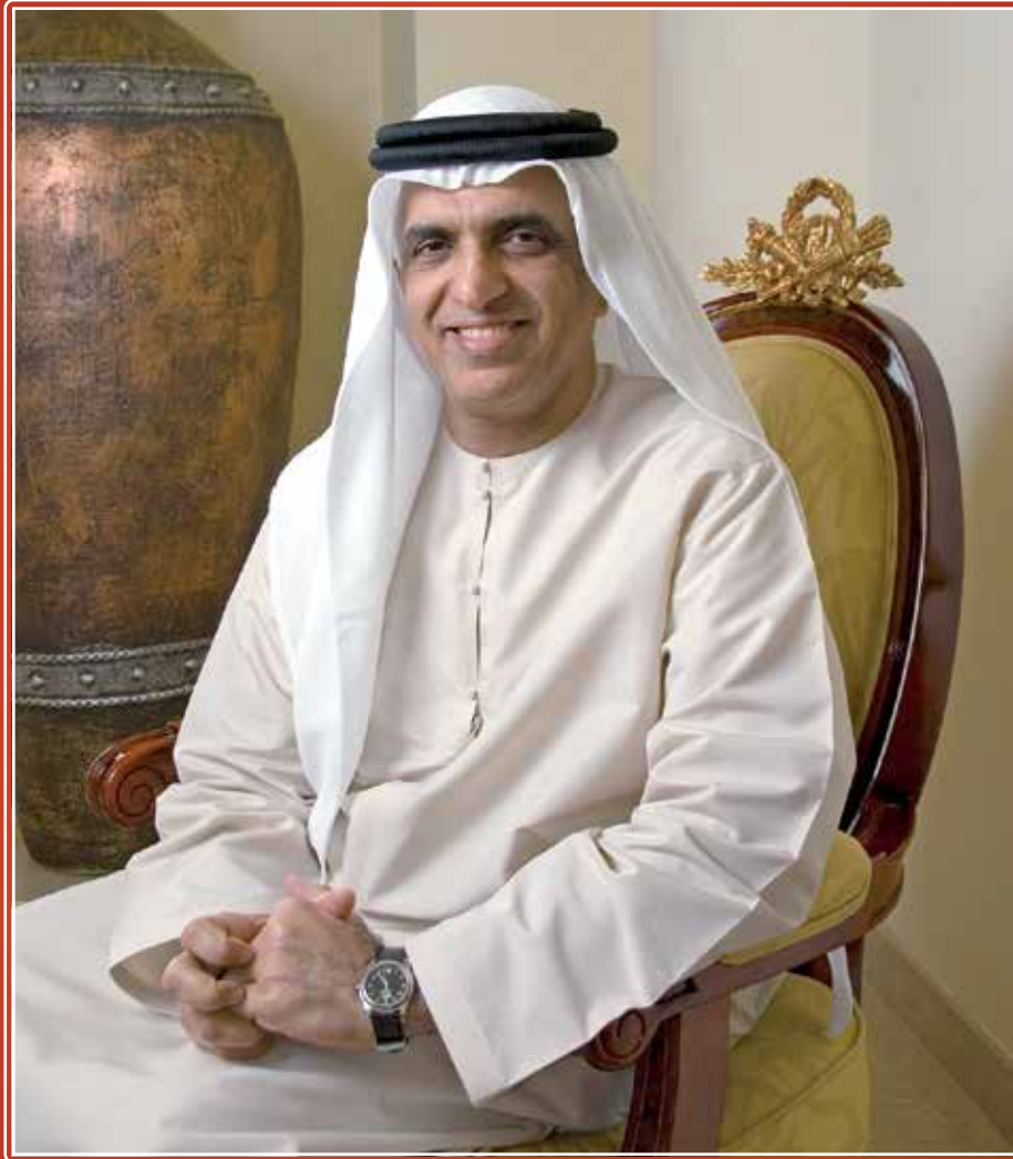
H.H. Sheikh Saud Bin Saqr Al Qasimi

Supreme Council Member and Ruler of Ras Al Khaimah