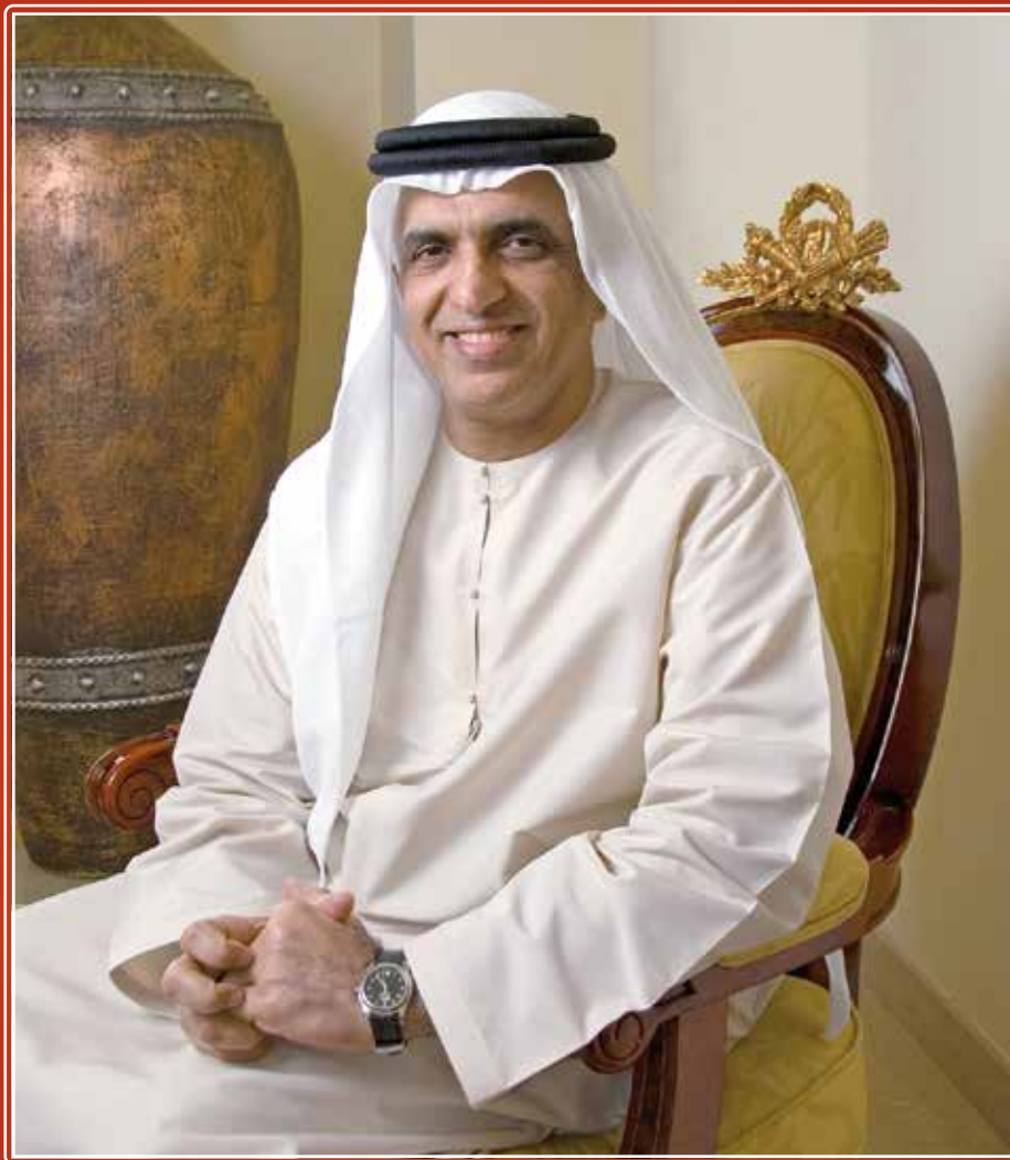
H.H. Sheikh Saud Bin Saqr Al Qasimi

Supreme Council Member and Ruler of Ras Al Khaimah