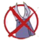
Low-cut Blouses/T Shirts